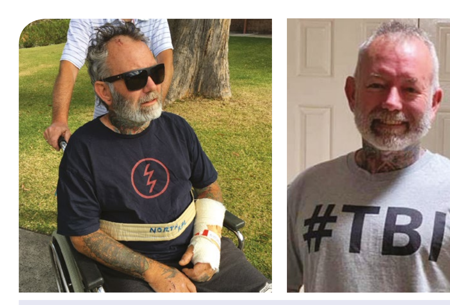
My battery is never full, and I understand it never will be. For 30 years I got up before 6am and I could work all day on a roof. Now the mental fatigue drains my battery.